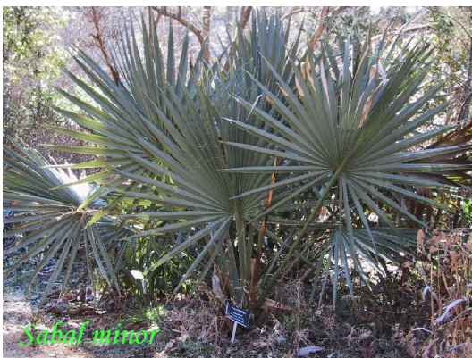
Sabal minor , North Carolina Botanic Garden, Chapel Hill, NC

Native to Texas, south to Mexico and Nicaragua, Sabal mexicana is a robust, tall, and impressive palm. The trunk retains the boots of dead leaves for a long time, giving the palm a stout and robust appearance. Sabal mexicana prefers full sun in a well-drained but moist soil. Expect leaf damage to begin about 14F. Z8b, 8a