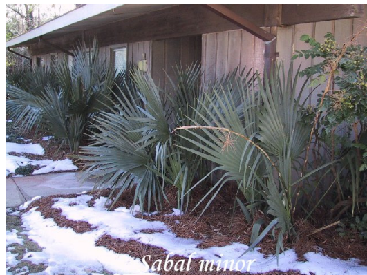
Sabal minor Sabal minor , Jaycee Park, Raleigh, NC.