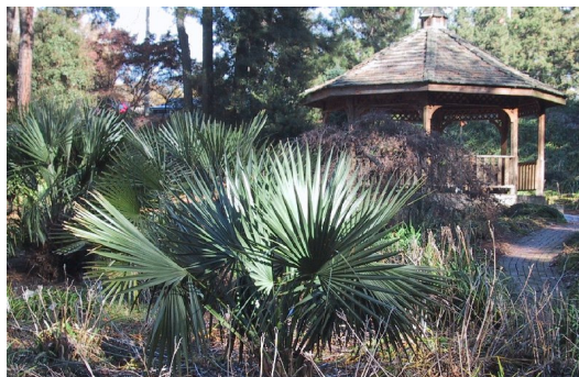
Dwarf Palmetto ( Sabal minor ), the cold-hardest palm.