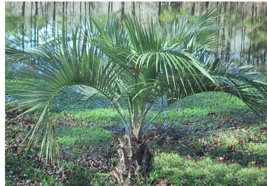
Young Butia capitata , Lee County, NC

Brahea nitida Guatemala Rock Palm: Native to Guatemala. Brahea nitida is the only Brahea whose leaf petioles are not armed. Z9a, 8b.