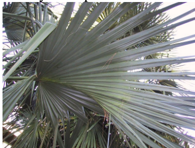
Rachis on a very costapalmate leaf.