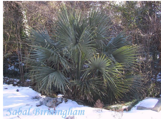
Sabal 'Birmingham' at Jaycee Park, Raleigh, NC.

Sabal etonia Scrub Palm: Sabal etonia is native to the endangered Florida Scrub plant community in well-drained sandy soils under the hot, baking sun of Florida's peninsula. Sabal etonia does not normally form a trunk, although specimens with several feet of upright trunk are known. Z8b, 8a.