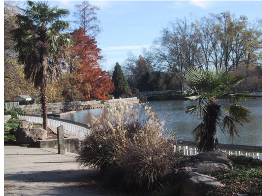
Windmill Palms, Pullen Park, Raleigh, NC.