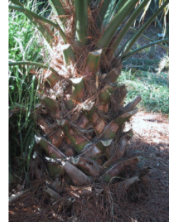
Trunk showing leaf boots.

Trunk: The aerial or underground body that bears the leaves. When visible above ground (aerial), the palm is said to have a trunk.