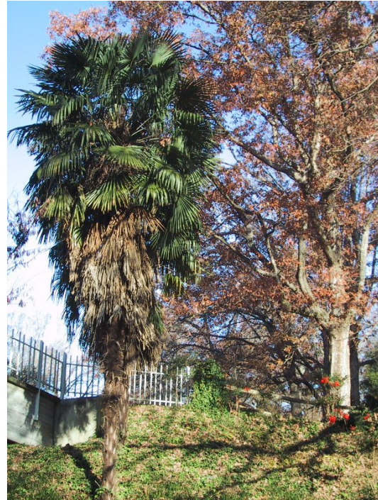
Trachycarpus fortunei , Pullen Park, Raleigh, NC

growth characteristics used to identify T. takil can be found in the variable populations of T. fortunei . Always room for more study. Z7b, 7a?