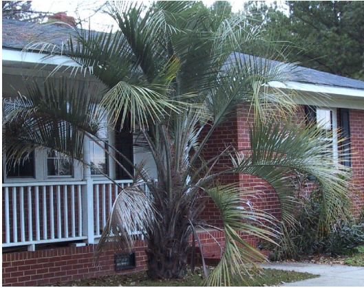
Adult Butia capitata , Lee County, NC

although adequate moisture is needed. Full sun or part shade is best for most varieties. As the name implies, the fruits of some species are used to make jelly.