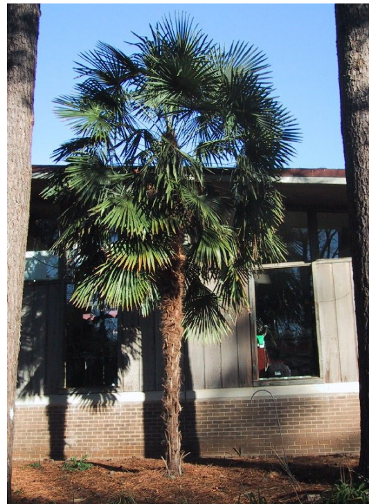
Trachycarpus fortunei , Jaycee Park, Raleigh, NC

Trachycarpus 'Bulgaria' Bulgarian Windmill Palm: Not native to Bulgaria, but worthy of recognition. Fifty-year-old specimens in Plovdiv, Bulgaria have withstood numerous exposures to temperatures below 0F. Seedlings of these palms are highly sought after for good reason. Trachycarpus 'Bulgaria' has smaller leaves and a tighter appearance than T. fortunei . Z7b, 7a?