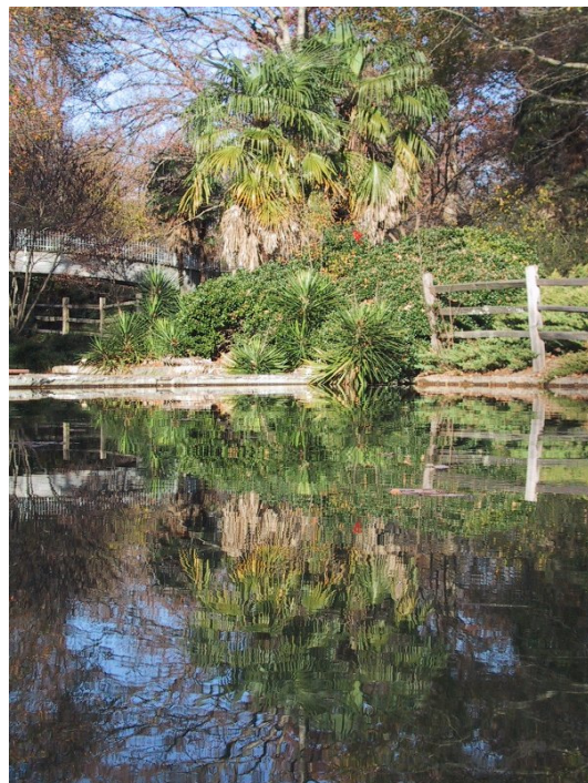
Windmill Palms, Pullen Park, Raleigh, NC.