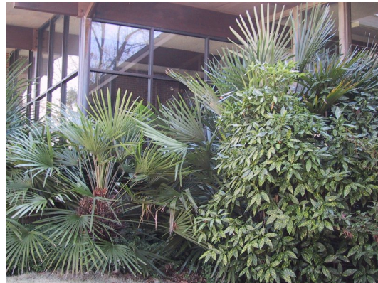
Needle Palms at Jaycee Park, Raleigh, NC.

Phoenix theoprastii Crete Date Palm: From Crete comes the reportedly cold hardiest date palm. Crete Date Palm sports silvery green leaves and often multiple trunks. Z8b.