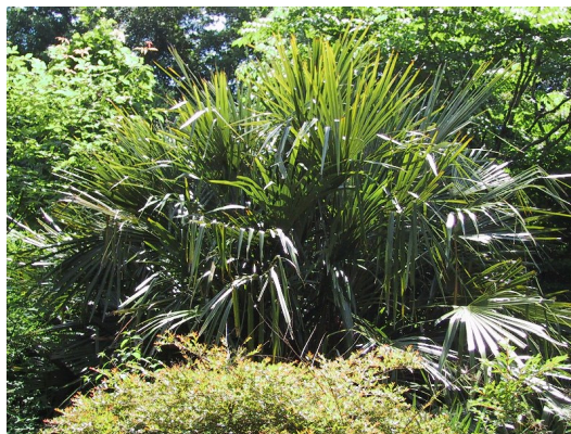
Needle Palm ( Rapidophyllum hystrix ), the cold-hardest trunk-forming palm.

I present to you an introduction to the cold hardy palms.